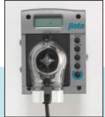
SingleShot, the "baby" of Beta's laundry line, was a big hit at Clean 2003.

Although we all returned to the office tired, everyone agrees that the effort was well worth it. See you at Booth #946 at ISSA in Chicago!