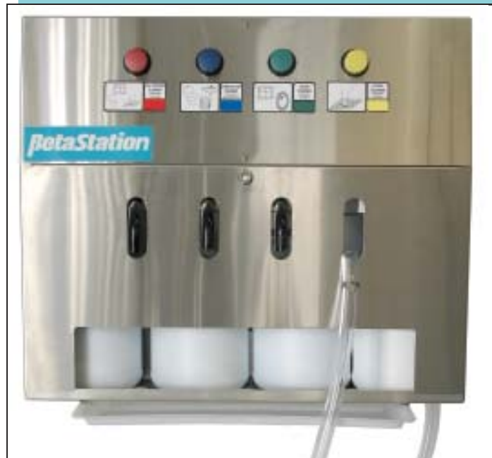
BetaStation has a lockable stainless steel enclosure and holds up to four one-gallon bottles.

Small Wire Rack (1 x 1 gallon) Code #1203104 Large Wire Rack (4 x 1 gallons) Code #1203105