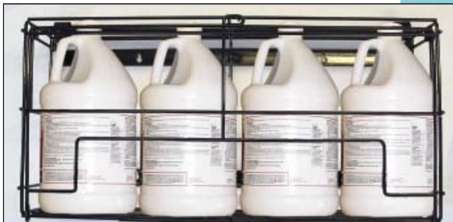
Keep your chemicals under lock and key. Four one-gallon bottles may be locked inside BetaJet's wire rack.