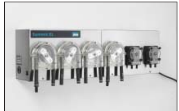
Summit XL made its performance debut at Clean '03.