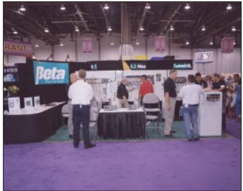
Laundry Central: The Beta booth was wired for action at the Clean '03 show, with ILS, ILS Max and Summit XL up and running.