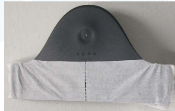
Two DuoClean cloths assembled over the bottom of a 24" DuoClean