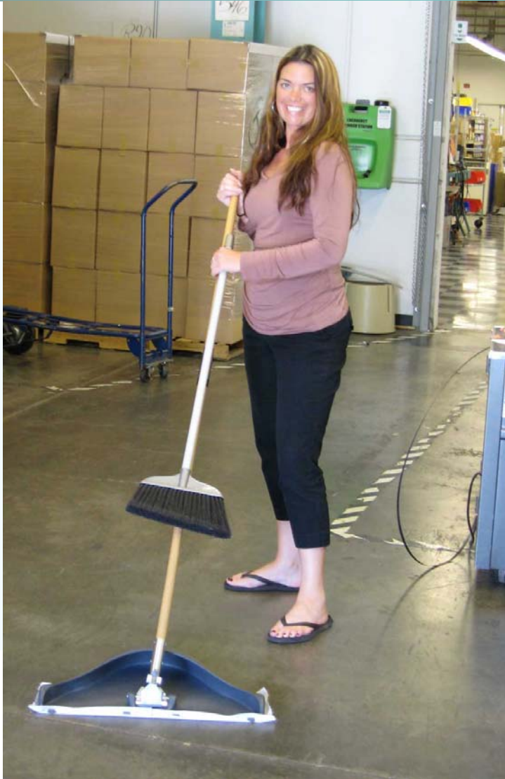
How to Use DuoClean