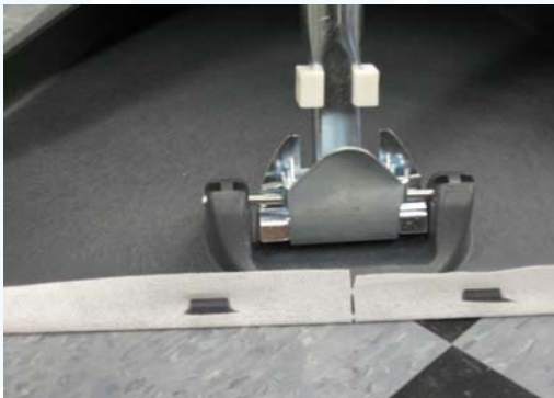
Mop handle clip attached to DuoClean