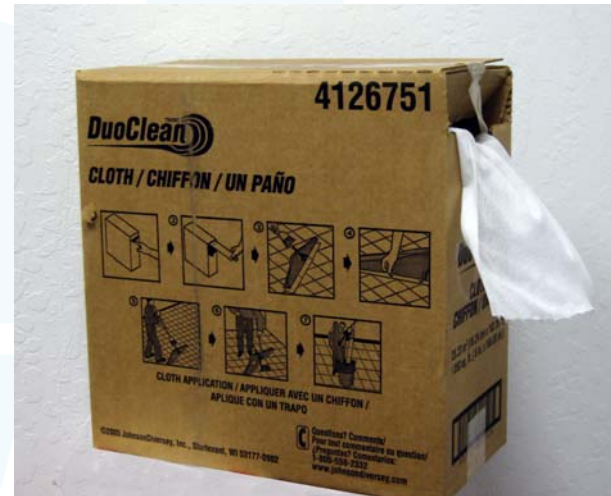
Box of 500 DuoClean microfiber cloths