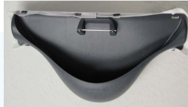
Two DuoClean cloths assembled onto front plastic tabs of a 24" DuoClean