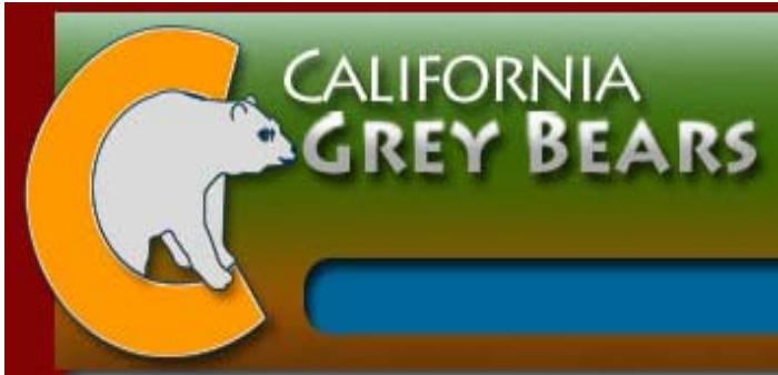
Grey Bears Tracking