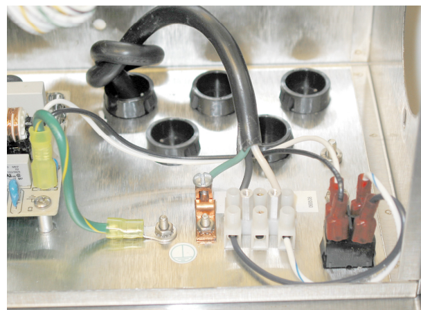
Inside of Summit (with power cord), Non-TUV Compliant